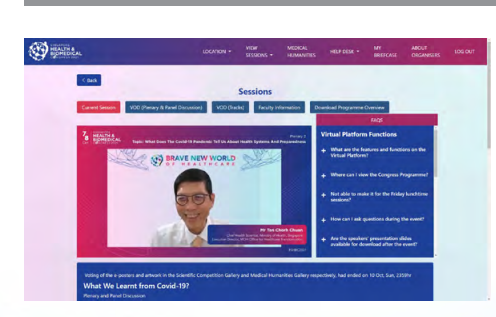
On demand content available until Feb 2022.