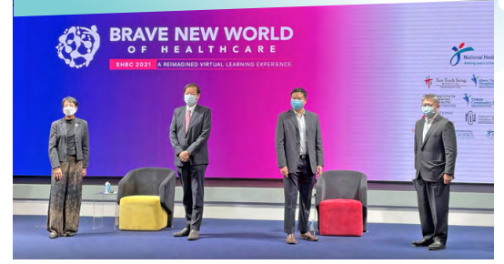
SHBC 2021 Complimentary to All, Access Extended to Feb 2022