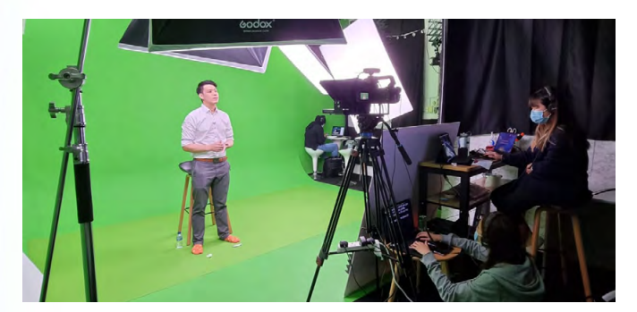
Behind the scenes. The Teachers' Day team preparing to broadcast live.